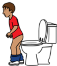
sit down on the toilet