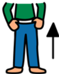
pull up pants