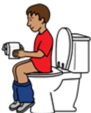
get toilet paper